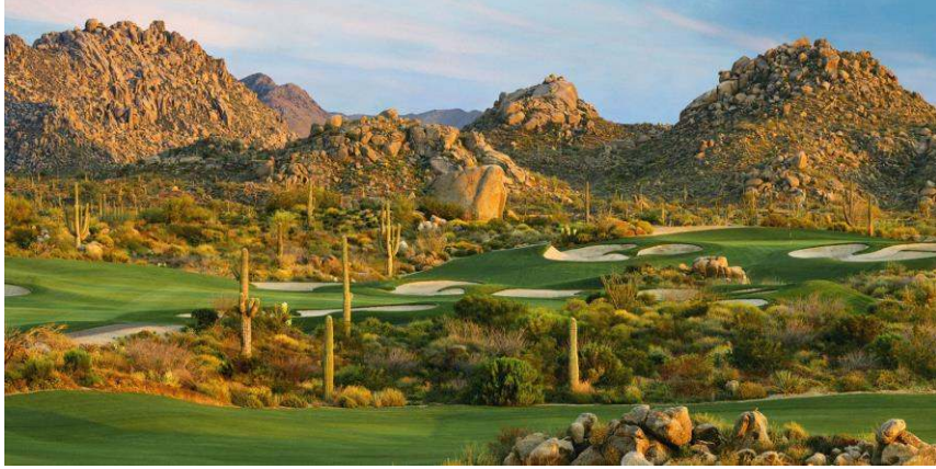
Tron North Camelback Padre Wolf Creek Mesquite Paiute The Wolf